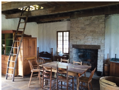
main room, Bequette Ribault House